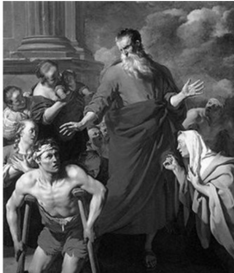
St. Paul Healing the Cripple at Lystra by Karel Dujardin

CONNECTING YOUNGER GENERATIONS IN GOD'S LOVE