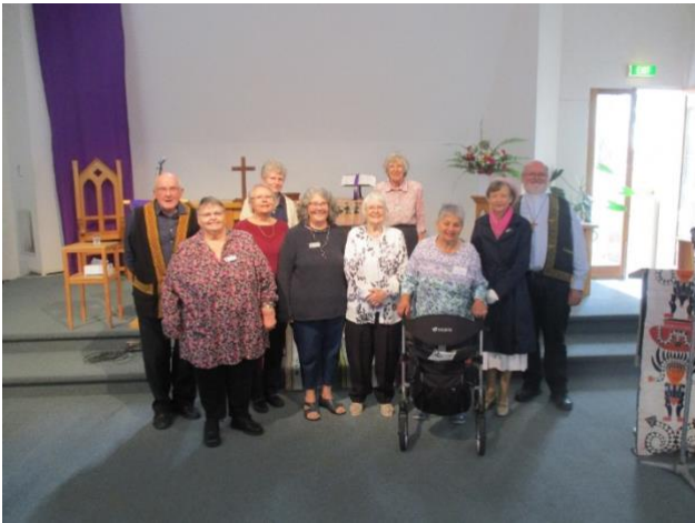
Participants in the service.

The service next year will be written by the women of Palestine on the theme “Bear with one another I love.”