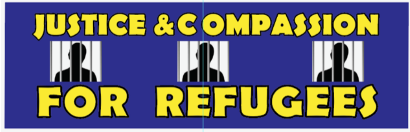
A shot of the banner currently in production

At our Pentecost service the newly formed Social Justice Group challenged us to come up with the finance for a banner proclaiming our Social Justice message. $650 was needed and was collected in a very short time. Further donations have swelled the coffers to $900. The balance will be used for Social Justice activities.